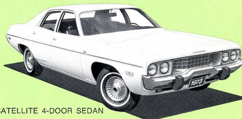
SATELLITE 4-DOOR SEDAN