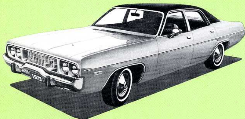
SATELLITE CUSTOM 4-DOOR SEDAN